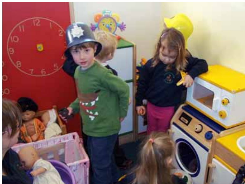
'Enjoying role play in the home corner'

Bratton Fleming Pre-School is a brand new purpose-built setting which opened its doors in February 2011. We are a small, friendly group that has grown and developed since the original Bratton Fleming Playgroup began in 1972. We are very proud of our new building, which we have been able to obtain thanks to extensive community fundraising and the support of Local Council grants. The Pre-School is located next to the village Primary School and we have strong links with the Staff and children there.