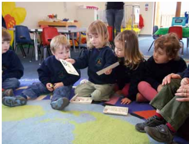
'Sharing and listening at circle time'

'Children are very happy and confident. They have high levels of self esteem because they are confident that they will be listened to and respected, and that their individual needs will be met. They benefit from an inclusive environment where the staff team's understanding and implementation of equal opportunities is very good.'