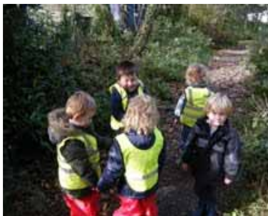
'Exploring the local woodlands'

Our Staff maintain regular links with the local Primary School through shared events based on the School's curriculum themes. Pre-School children also benefit from using the School's outdoor equipment, as well as experiencing the wider village spaces such as the local community play area, woodland and Nature Reserve.