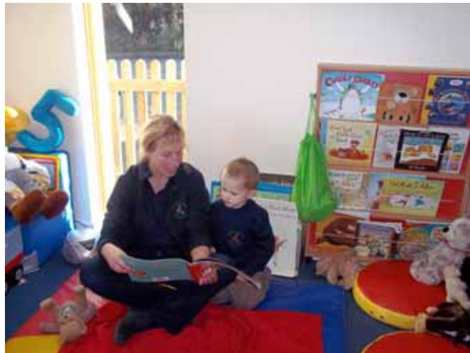
'Enjoying a story in the cosy corner'